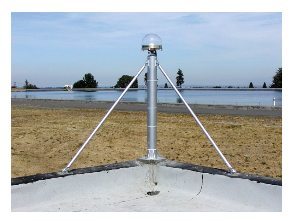
Reference Station at West Seattle Reservoir: originally established for plate tectonic studies and resources mapping, it was added to the state network with no modifications needed.

Grid" might seem a bit off subject to surveyors for an initiative name (and maybe even seem insulting to geodesists), it has proven effective in catching the attention of non-survey types (lets not get hung up on this one).