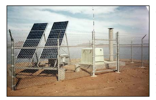
Figure 2. CGPS site at the East Dam

studies, boundary surveys) [5, 7], but we have not been able to utilize their capabilities for real-time surveys.