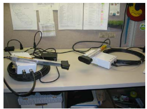
Figure 5. WiLAN radio benchtest

weather resistant enclosure. The field installation consisted of hanging a horizontally polarized semiparabolic grid antenna on a 1.5-in. galvanized pipe. The WiLAN radio (configured prior to field installation, Figure 5) was hung on the pipe just below the antenna. The antenna cable and PoE cable were connected to the appropriate connectors on the bottom of the WiLAN. The PoE cable was run down to the equipment box and through a strain relief connection being sure to leave enough of a loop or "drip line" on the outside of the enclosure. Inside the enclosure, the telemetry