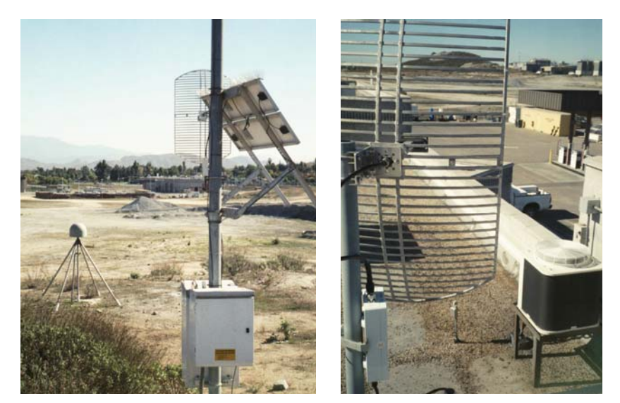
Figure 6. Remote CGPS site with antenna aimed toward backbone site (left) and backbone antenna on roof of building with LAN connection aimed at CGPS site (right).

At the preliminary site inspection, we realized that two of the sites had the equipment enclosure installed at the backbone communication building. In one case, the enclosure was mounted on the wall right next to the network router. We attached the buffer to the GPS receiver and then plugged a CAT5 cable directly into the back of the buffer and into the LAN router.