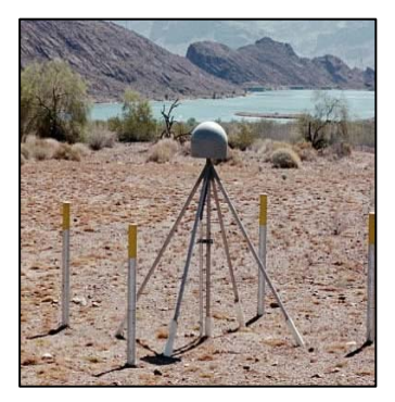
Figure 1. Typical SCIGN CGPS site

This project was undertaken to allow MWD surveyors to better utilize the continuous GPS (CGPS) sites that were installed on MWD property in the late 1990's. The CGPS sites were installed by the Southern California Integrated GPS Network (SCIGN; <u>www.scign.org</u>) [8] after the 1994 Northridge earthquake to study the crustal motion in southern California. The typical SCIGN site has a deeply anchored (~10 m), drill-braced monument (Figure 1). The CGPS sites have been used by MWD since their installation for static GPS surveys (control surveys, deformation